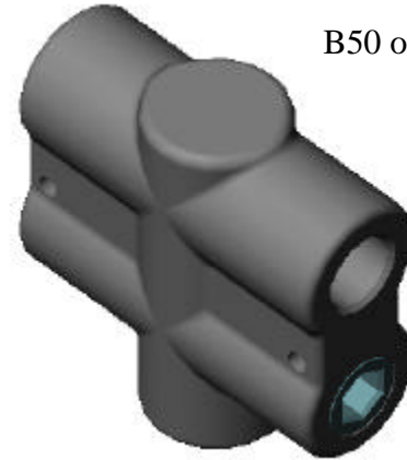
B50 or B100